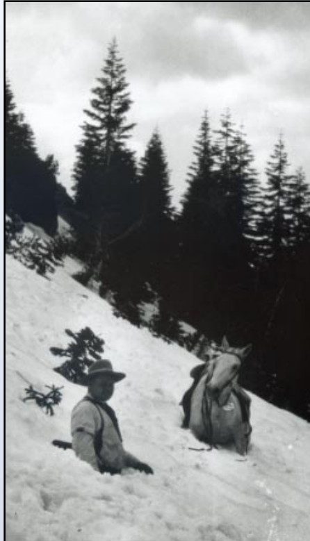
Game wardens have been protecting California's fish and wildlife for more than 100 years.

1870. The Board of Fish Commissioners, forerunner of the Fish and Game Commission, is established "to provide for the restoration and preservation" of fish in California waters. This was the first wildlife conservation agency in the country, even predating the U.S. Commission of Fish and Fisheries. California's three "fish commissioners," appointed by the Governor, received no compensation, but the Legislature appropriated $5,000 to the board for the first two years' operations. This same year the first fish ladder is built on a tributary of the Truckee River, and a